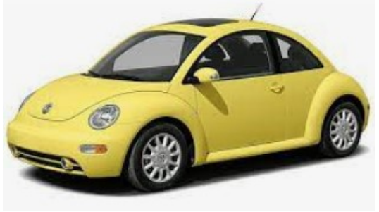
2005 Volkswagen Beetle

Near-immediate psychiatric treatment coupled with high strength anti-depressants, culminating in medical suicide watch.